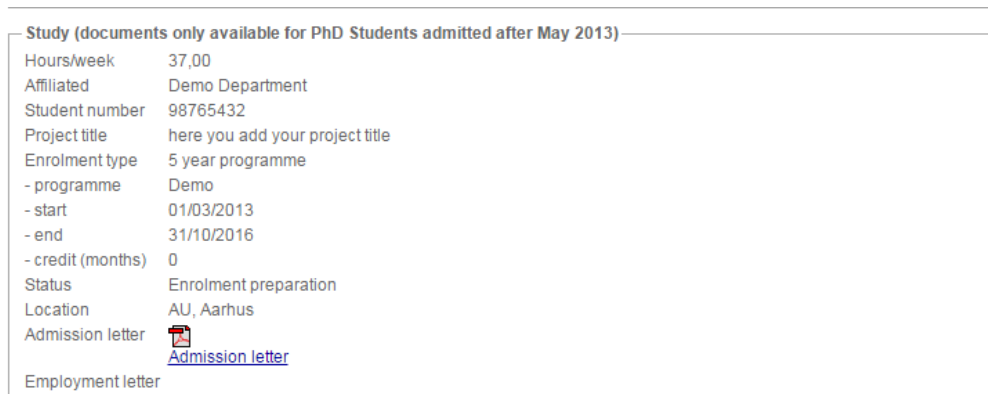
Figure 5: The 'Study' box under the 'my profile' at the 'Password and Profile' tab

This box contains various types of basic information about you and your enrolment and cannot be edited by you.